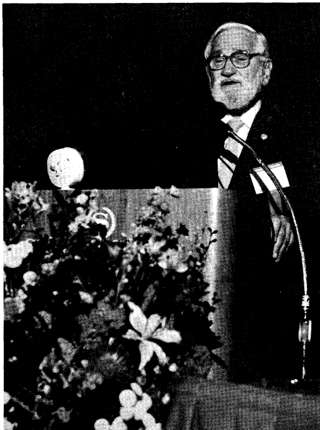
Albert B. Sabin, M.D., Guest Speaker